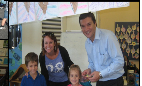
showing Mum and Dad my puppet; my sister didn't share her biscuits