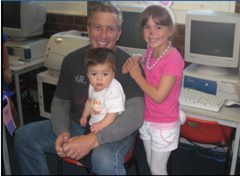
showing Mum and Dad the things I have done during the term