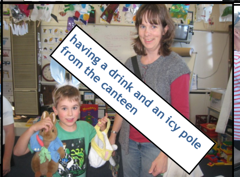
having a drink and an icy pole from the canteen