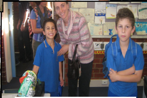
eating the cookies we made