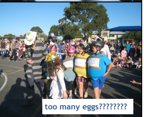
too many eggs????????