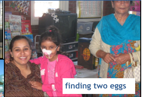
finding two eggs