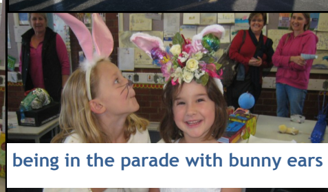
being in the parade with bunny ears