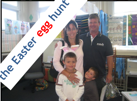
the Easter egg hunt