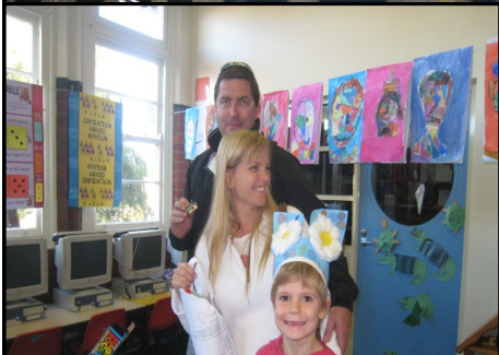
being in the parade with my bunny ears.