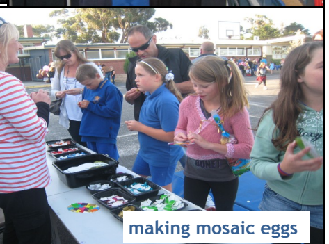
making mosaic eggs