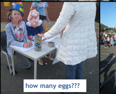
how many eggs???