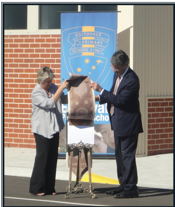
The Unveiling of the Plaque

Many thanks to the parents, students and teachers who joined us on Friday February 24 as the Honourable Mark Dreyfus QC, MP Federal Member for Isaacs officially opened our new building. Our learning centre provides us with a physical environment that supports the learning needs of our children in the 21 st Century. We love our new facilities and greatly appreciate the funding provided by the Federal Government. We were very proud to welcome all of our visitors and show them what a wonderful learning environment we have here at EPS.