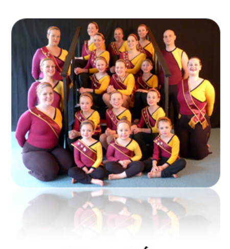
Aspire to Achieve