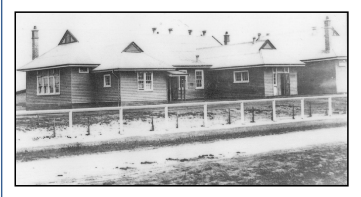
The original Edithvale State School, which was destroyed by fire in 1941

Tomorrow afternoon we will be having an extended 'centenary' assembly - it begins at 2.45 pm and we will spend some of that time on the much anticipated 'time capsules'.