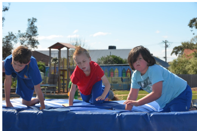
A few photos of our students having fun at the Fun Run!