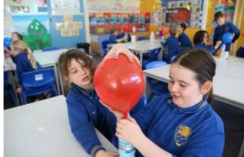
Science Day Fun!