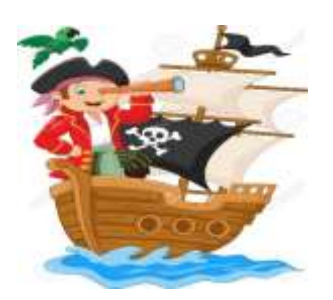
Arrrrrrrrrrrrh ! G'day shipmates!