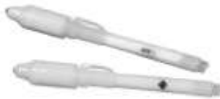
Invisible Ink Martian Pen

To help keep students on track with their savings mission in Term 2, we've released two new awesome reward items from our Outer Space Savers range. Students just need to make 10 School Banking deposits to be able to redeem a reward item.